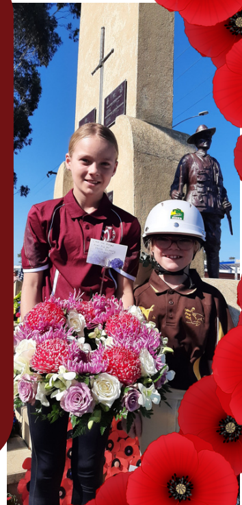
Yalmy - Yellow house