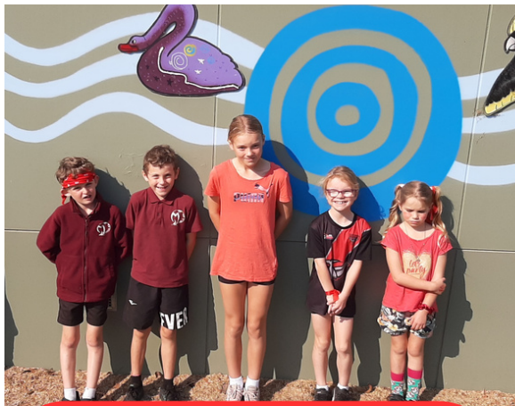
Curlip - Red house