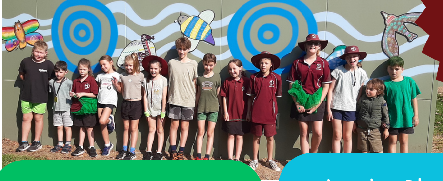
Ellery - Green house